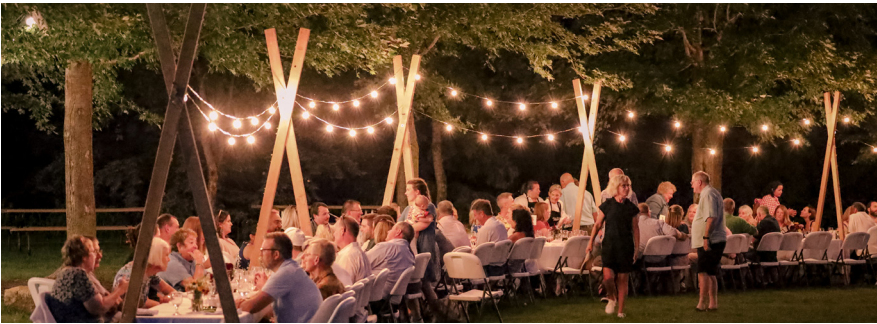
Table Sponsor (8 seats)